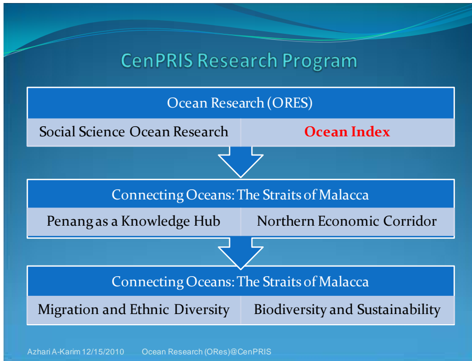
Diagram 3 CenPRIS Research Programme

A maritime area like the Straits of Malacca, the Sulu Sea or the South China Sea might qualify to be categorised as large marine ecosystems (LMEs). LMEs are distinct ecological regions that extend from the coast to the edge of the continental shelf. LMEs are economically important, producing goods and services—including 95 percent of the world’s fish yields—worth billions of dollars a year. Because LME coastlines are heavily populated, these ecosystems are often among the most polluted and degraded on Earth. The economic value of LMEs demands that their resources and habitats are protected and managed sustainably for both present and future generations. Often this requires international cooperation, since most LMEs span the maritime jurisdictions of more than one country.